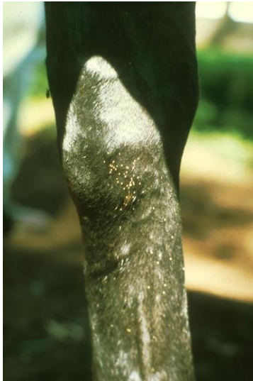
Bot fly eggs on horse's leg

Worming is also very important, so make sure you keep up its regular worming programme (every 6-8 weeks) and keep paddocks clean of manure to stop horses being reinfected by worms from the manure. Remember to remove any bot eggs (tiny yellowish white eggs laid by bot flies especially on horse's legs) daily.