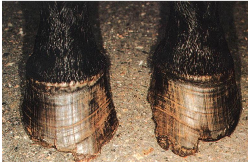
Hooves in poor condition in need of trimming

If your horse has not had its annual tetanus/strangles injection, arrange to have it vaccinated. If its teeth have not been checked in the last year, this can be done by your vet or horse dentist.